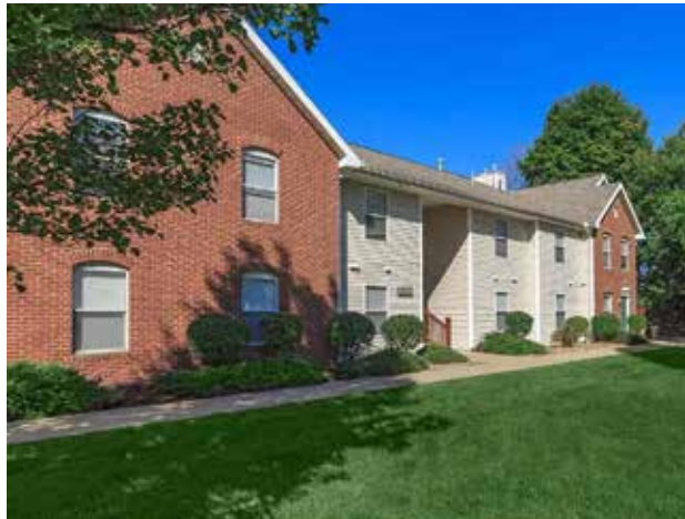
BIG SKY PARK Wadsworth, OH