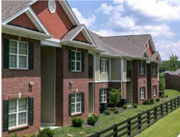
THE LAKES AT WEST CHESTER VILLAGE West Chester, Ohio